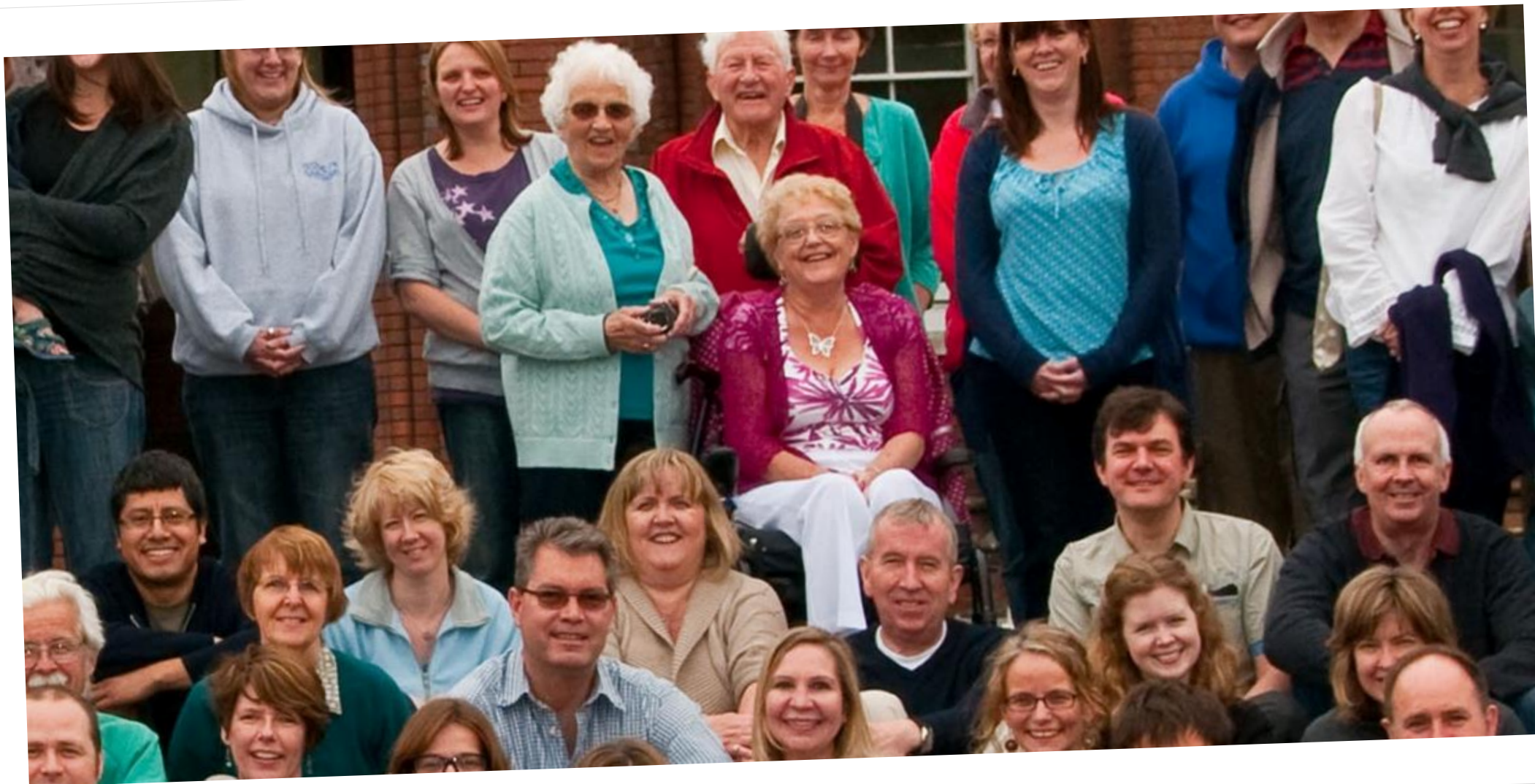
Away weekend House Party